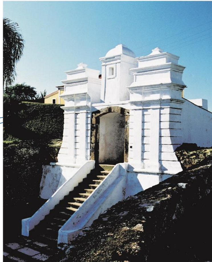
18_ Fortaleza Santa Cruz de Anhatomirin, 1739 Santa Catarina