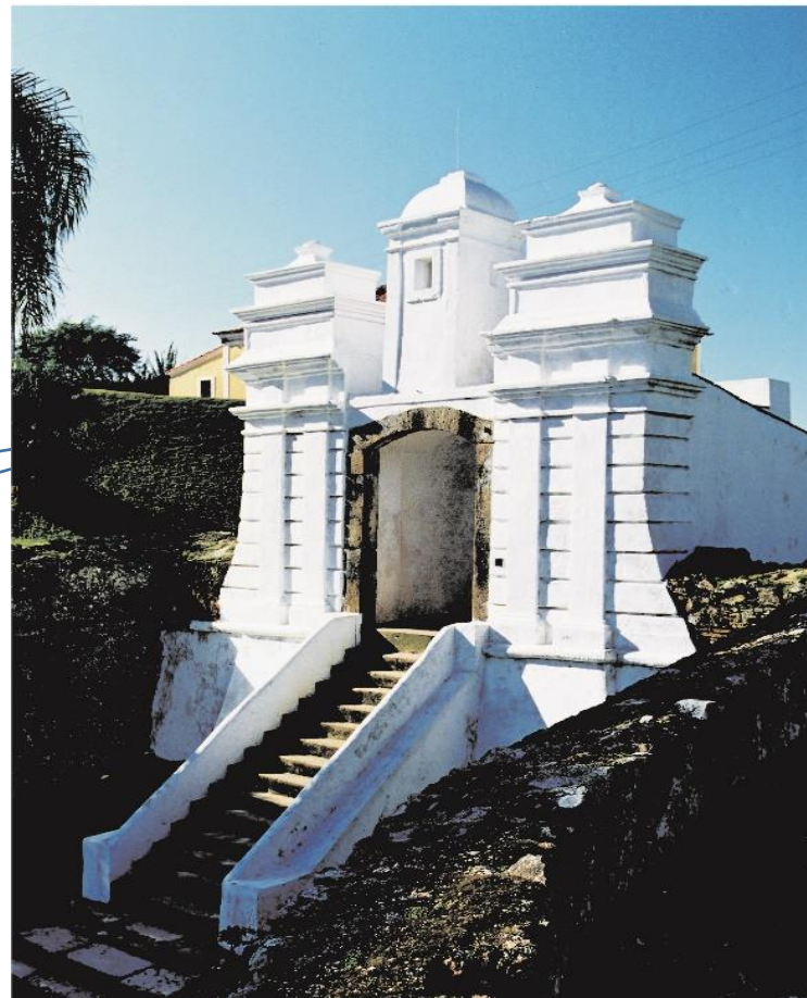
18_ Fortaleza Santa Cruz de Anhatomirin, 1739 Santa Catarina