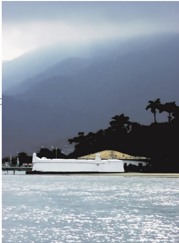
16_ Fort São João, 1532 / 1551 São Paulo