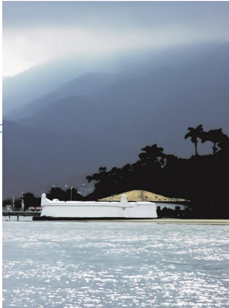
16_ Fort São João, 1532 / 1551 São Paulo